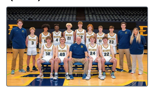
Jr. Buccaneers Johnson City, TN Washington County Region 1, District 1